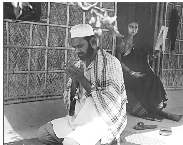
Jamila, the young wife of Majid, eventually becomes his nemesis

Jeonju International Film Festival intends to anticipate the future of Asian cinema in the new millenium with an affectionate and critical stance. As a