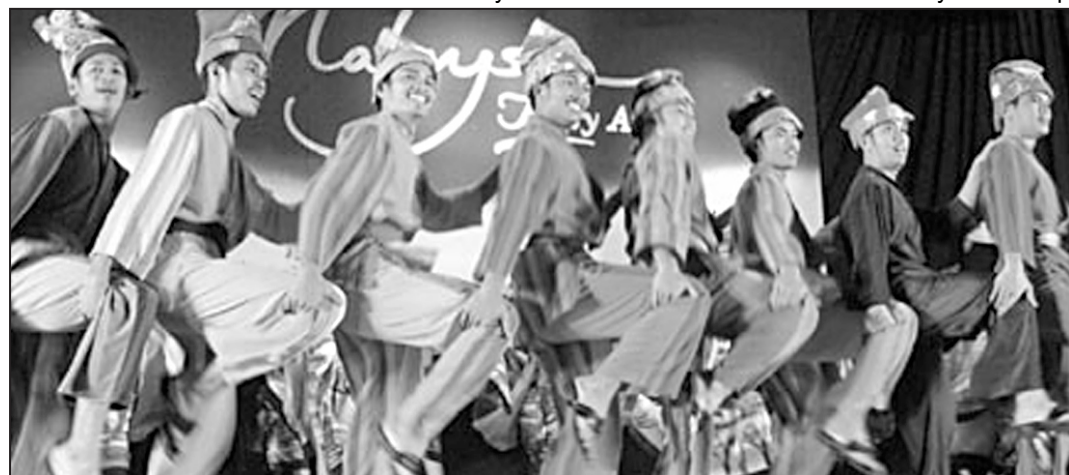
Spectacular performance by Malaysian artists bemuse the audience

The cultural splendour of Malaysia did cast a spell on the audience and will last in their collective memory for a long time to come.