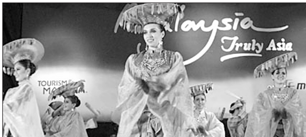
The event is in progress before a large audience

The guests were received with sincere modesty and lovely smiles. The brilliant performers bowed to them welcoming to the cozy auditorium. In his laconic and witty speech the minister of the arts, cultural affairs and tourism gave an overview of the rich multicultural background of his country which is like a confluence of different cultures and races of Asia. The theme of the eve was Malaysia truly Asia upholding