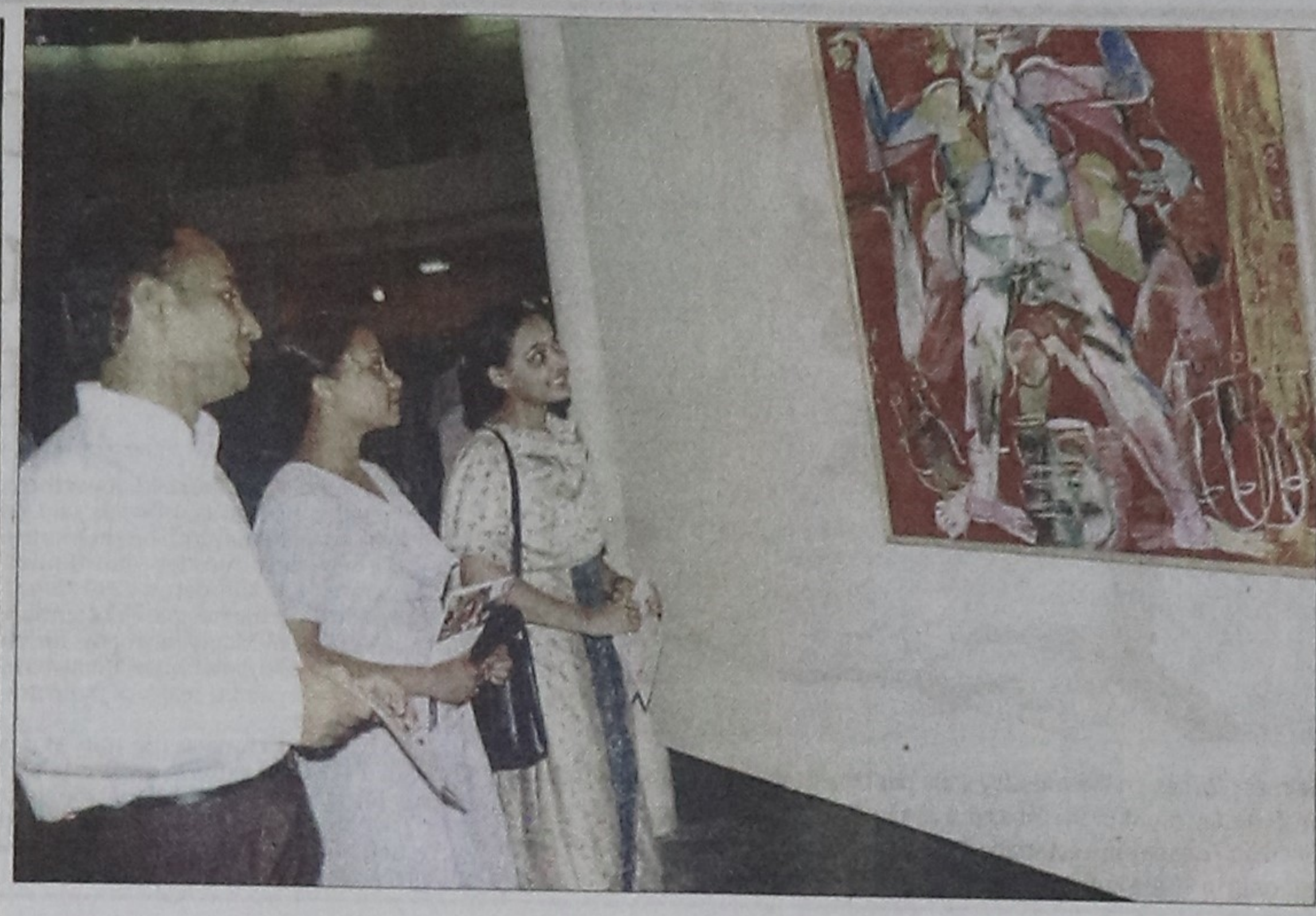
Visitors at an art exhibition of ten contemporary artists that began at the Shilpakala Academy in the city on Tuesday. The Bangladesh Institute of Labour Studies and the Shilpakala Academy jointly organised the show.

Silver jubilee ceremony The silver jubilee ceremony of Nbedita Sangeet Niketon will be held with State Minister for Cultural Affairs Selma Rahman as chief guest. Venue: TSC auditorium of Dhaka University. Time: 3:00pm.