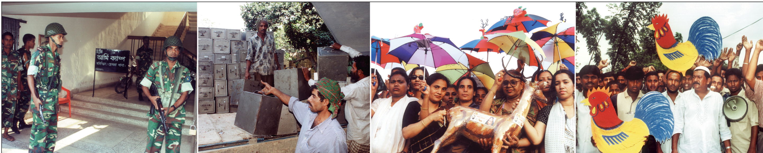
Election preparation... army men guard a city polling centre as part of the massive security measure for the city corporation polls; ballot boxes are being unloaded; and campaigners canvass with umbrellas, replica of deer and cock.