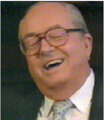
Jean-Marie Le Pen