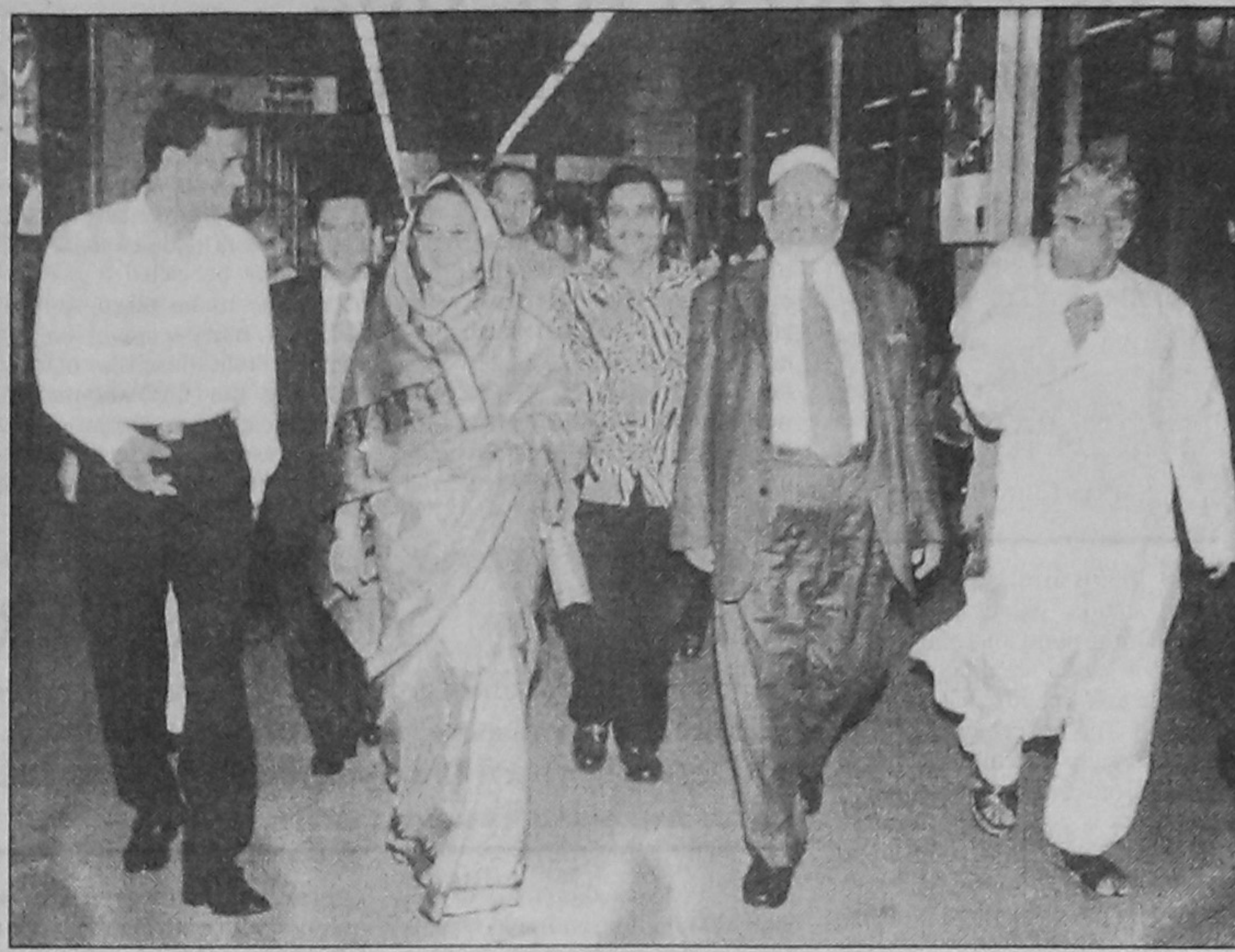
Awami League leaders saw Leader of the Opposition in Parliament and party chief Sheikh Hasina off at Zia International Airport in the city yesterday prior to her departure for London.