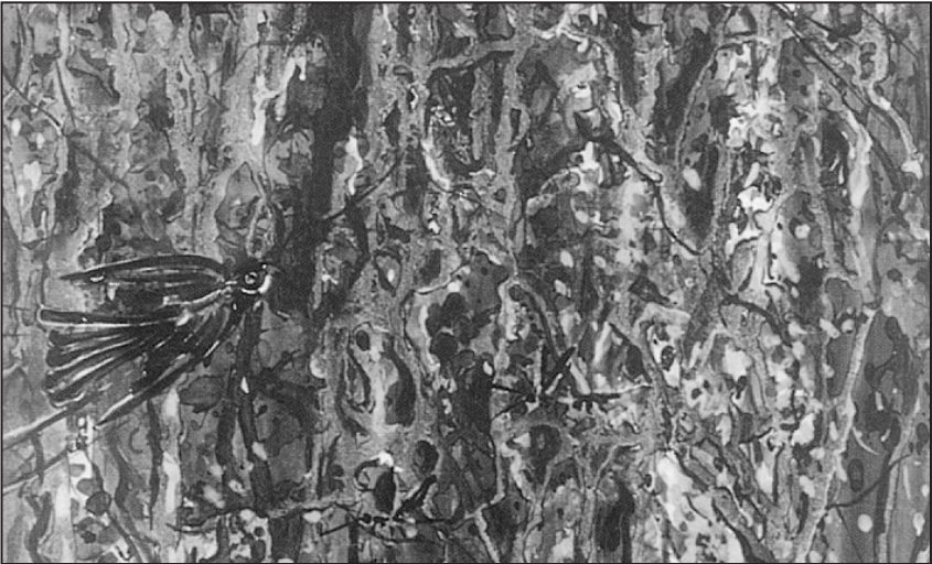
Nature - 1994 water color 48x38 cm