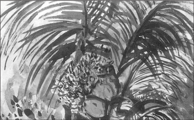
Nature - 1990 water color 36x27 cm