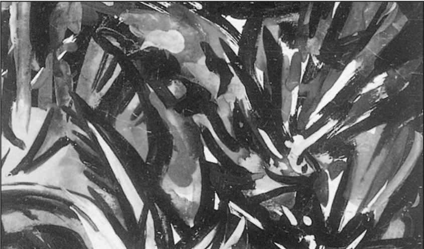
Bird - 1989 water color 25x24 cm

ZUNABUL Islam's second posthumous solo exhibition, featuring watercolor works of the artist, starts from today at Zainul Gallery of the Institute of Fine Arts in the city. Rokeya Islam, wife of the late artist, hosts the exhibition.