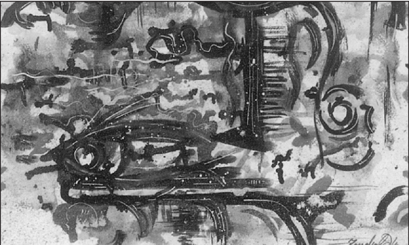
Fish - 1989 water color 47x33 cm