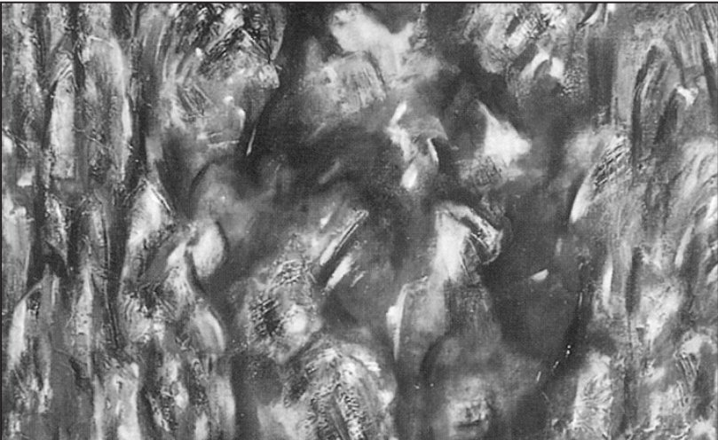
Composition-1990 oil 86x86 cm

Weeklong solo watercolor exhibition of late artist Zunabul Islam begins at Zainul Gallery of the Institute of Fine Arts in the city from today