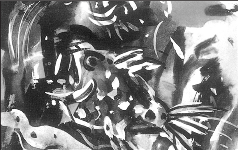
Fish - 1991 water color 24x18 cm

The exhibition will remain open till April 28 from 2 p.m. to 8 p.m. everyday.