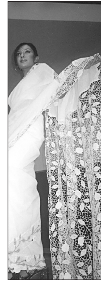
Off white shade reflects purity

mirror, ornaments and hand-embroidered floral patterns.