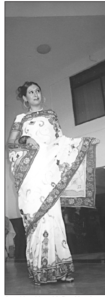
A sari in white with floral border