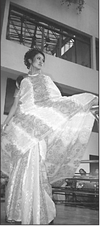
Bright shade brings festive mood

Saris, those were displayed at the show, contained chiffon, silk and cotton fabrics with accessories of