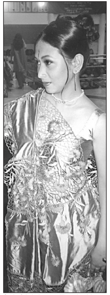
Satin fabric in metallic ash with net