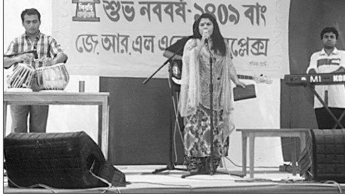
Celebration of Pahela Baishakh at JRL Elega Complex in Tangail in progress

Private tourism firm organizes a glitzy festival to celebrate the early hours of Pahela Baishakh