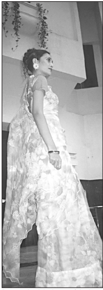
Patterns in pink give a soft look