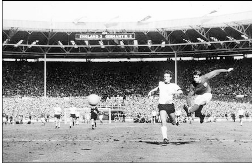
HURST DOES IT FOR ENGLAND: World Cup Final, 1966. Wembley, England. 30th July, 1966 England 4 v West Germany 2. England forward Geoff Hurst scores the fourth goal of the game in the dying seconds to complete his hat-trick and seal England's first ever World Cup victory.