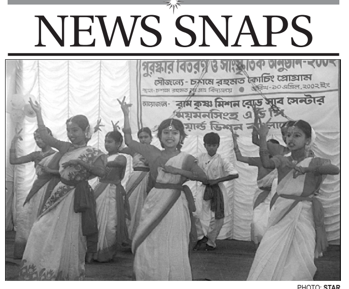
Child artistes dancing at a cultural function organised recently by the World Vision, Mymensingh at the local Ram Krishna Asram on the occasion of the prize distribution ceremony among the staffers of the Area Development Project (ADP) of the organisation for their good performance.