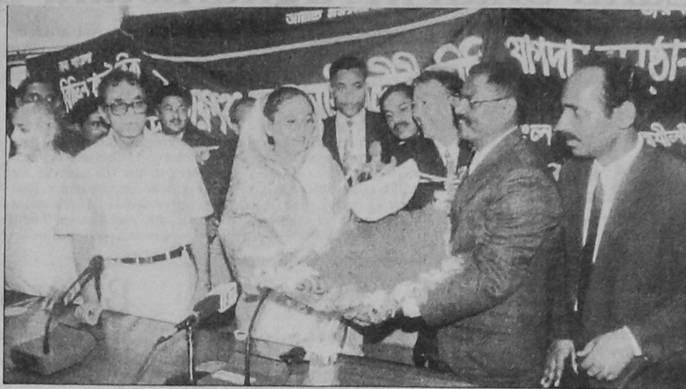
Newly elected leaders of the Kishoreganj Bar Council greeted Leader of the Opposition in Parliament and Awami League chief Sheikh Hasina with a bouquet at the National Press Club in the city yesterday.

Police arrested 1,340 people, including two listed criminals, from across the country and seized nine firearms, six other types of arms and 20 bullets in the last 24 hours ending at 6 am yesterday.