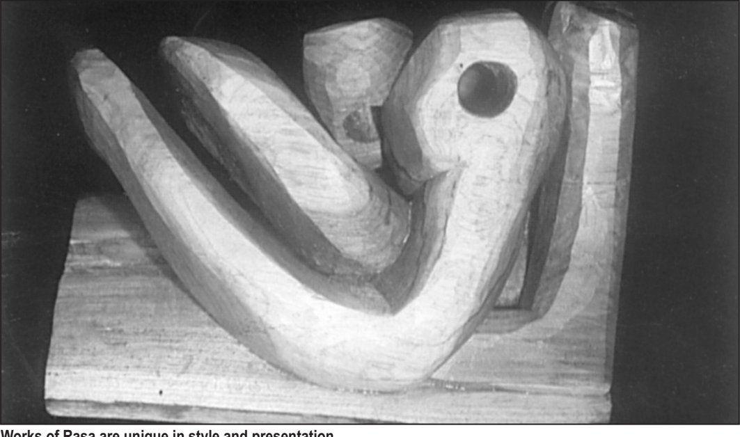
Works of Rasa are unique in style and presentation

The exhibition that started on April 13 continues till tomorrow from 11:00 a.m. to 7 p.m.