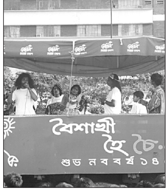
Square group celebrate Pahela Baishakh at Ramna Botomul in the city with sponsorship from Mediacom