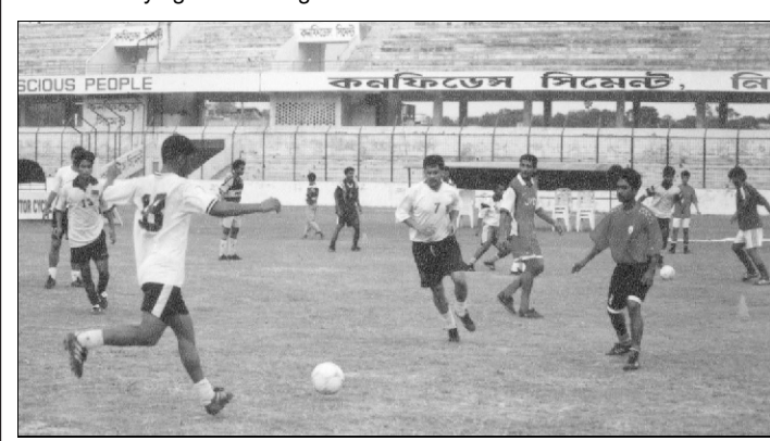
Mohammedan players having some practice at the MA Aziz Stadium in Chittagong yesterday. Mohammedan face local side Mohsin Club in the Nitol-Tata National Football League at this ground today.