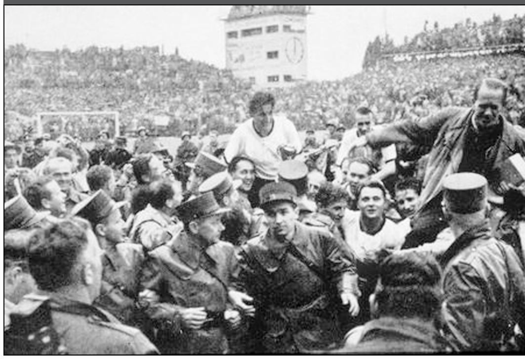
World Cup Final, 1954. Berne, Switzerland. 4th July, 1954. West Germany 3 v Hungary 2. West German captain Fritz Walter and coach Sepp Herberger are carried aloft after their victory.