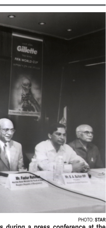
State Minister for Youth and Sports Fazlur Rahman (C) speaks to reporters during a press conference at the Bangladesh Football Federation office yesterday.

Scoreboards of the three GrameenPhone Premier Division Cricket League matches at different