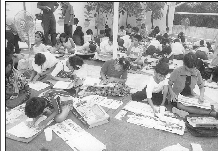
Child artists participating in the competition

and children at play. Together those art works made up a vibrant rural landscape offering vitality of pleasant lush greenery. One piece among those gave a rural view composed of stake of straw, a thatched house, a well, paddy field, date trees and a little girl feeding chicks. Some others had images like flying birds over running brook, village children playing in the green field, sailing boats, boatman rowing on a calm river. In another work had an image of a village cowboy under the shade of a tree with his cattle grazing in the field, while another piece depicted a little girl under jack fruit trees floating tiny paper boat on the running canal. Another was a portrayal of rainfall while a group