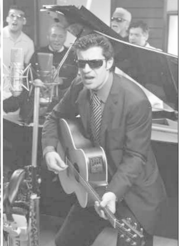
FOOTBALL CAN WAIT! (L) Brazilian superstar Ronaldo taking a dip in the swimming pool of Lisbon's Hotel Meridien on April 16. (R) Rockstar Luis Figo leads other Portuguese national team players in the recording of a song on April 15 at a recording studio in Lisbon. The song is intended to be the Portuguese national team theme during World Cup.