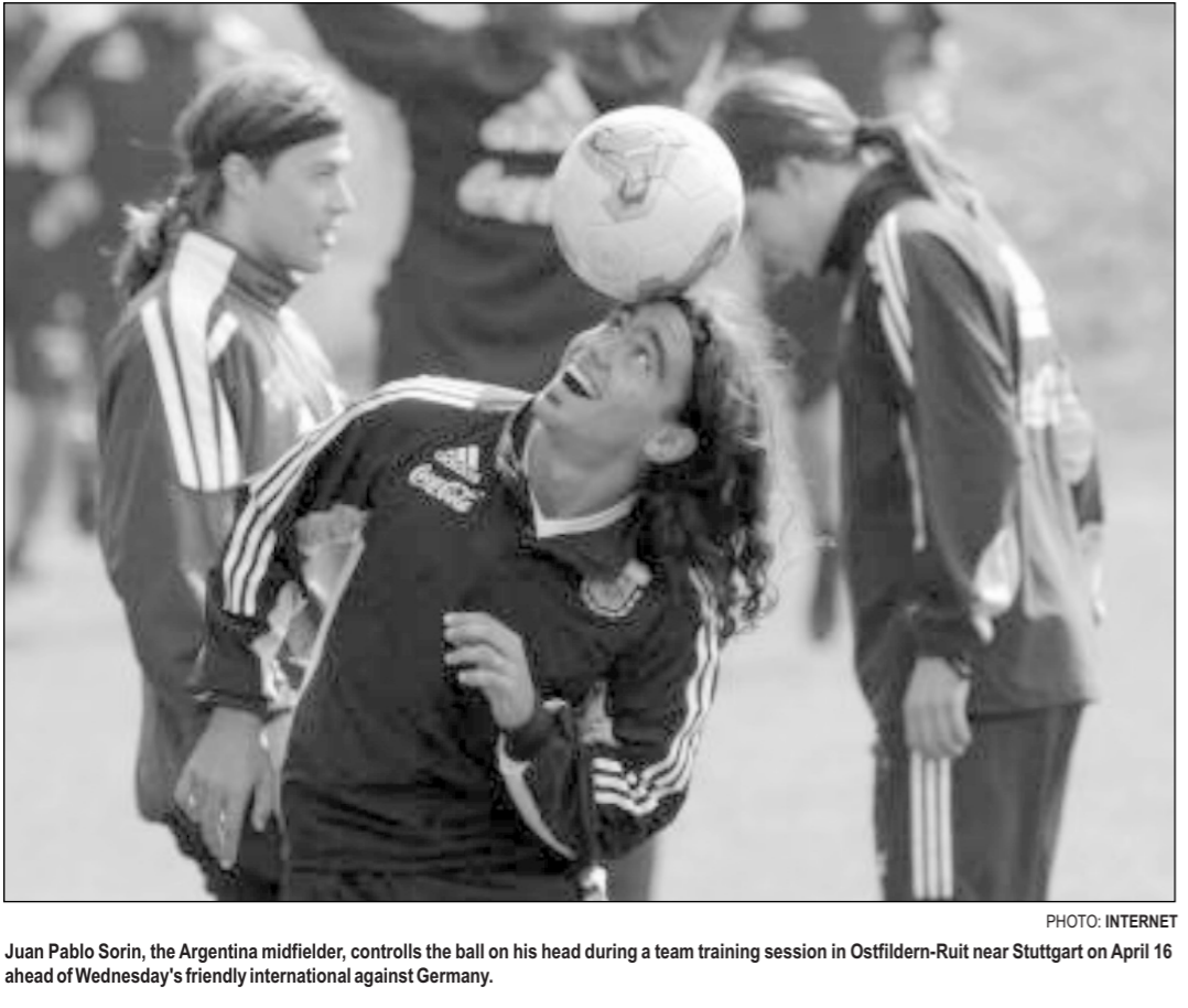
Juan Pablo Sorin, the Argentina midfielder, controls the ball on his head during a team training session in Ostfildern-Ruit near Stuttgart on April 16 ahead of Wednesday's friendly international against Germany.

Surprise call-up Matt Jansen is likely to feature at some stage as Eriksson experiments with his attacking options. The Blackburn Rovers striker has earned a late chance to earn a place in the World Cup squad following a string of impressive performances at club level.