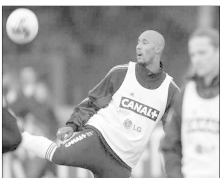
Nicolas Anelka, doing some ball juggling during a practice session of the French national team in Clairefontaine southwest of Paris on April 15.

Youri Djorkaeff has one foot in the door of France's World Cup squad - but Nicolas Anelka is still trying to barge his way in as the world champions prepare to face Russia here Wednesday.