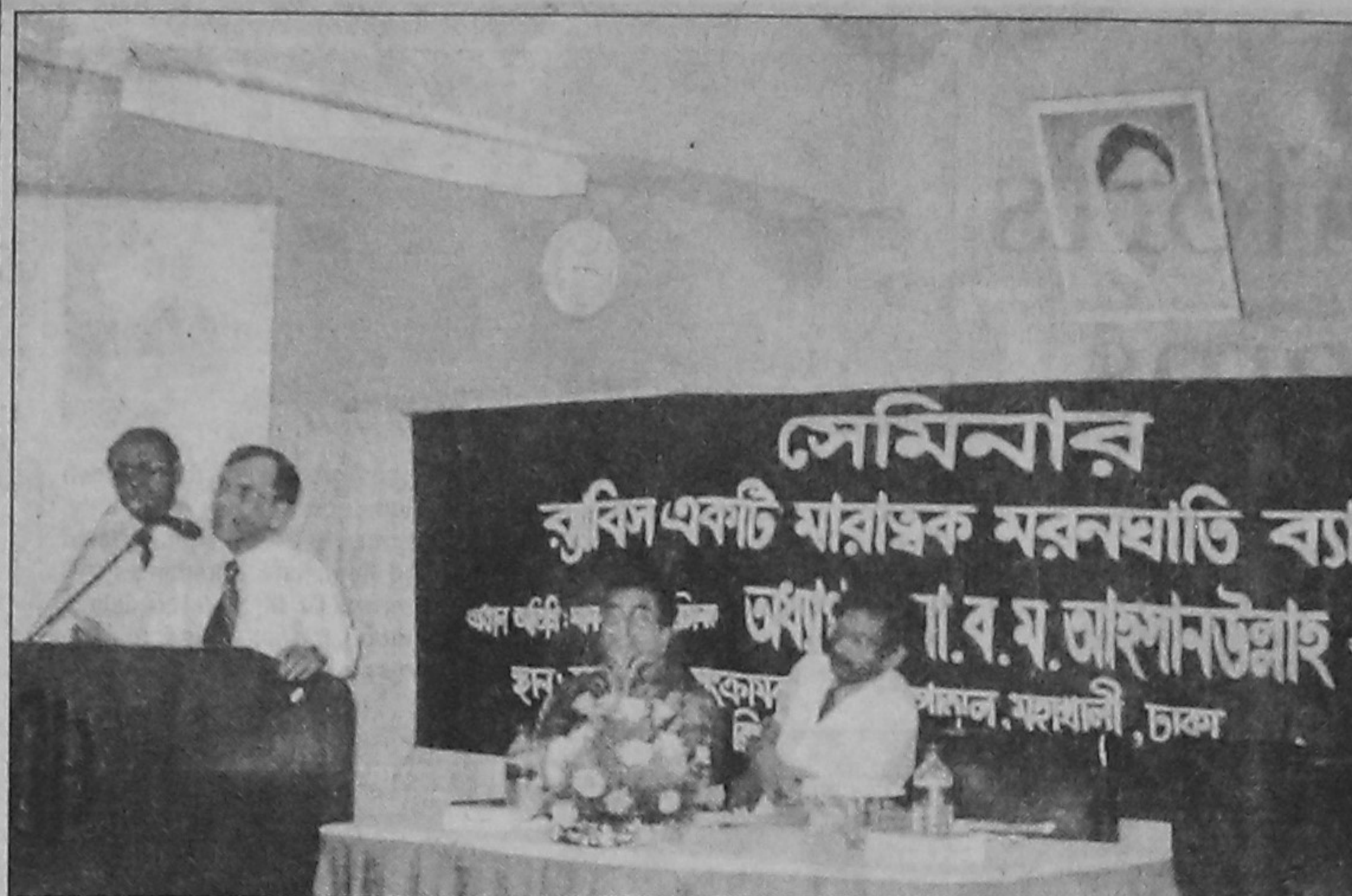
A scientific seminar on 'Rabies - A fatal infectious Disease' was held at the Infectious Diseases Hospital in the city yesterday.