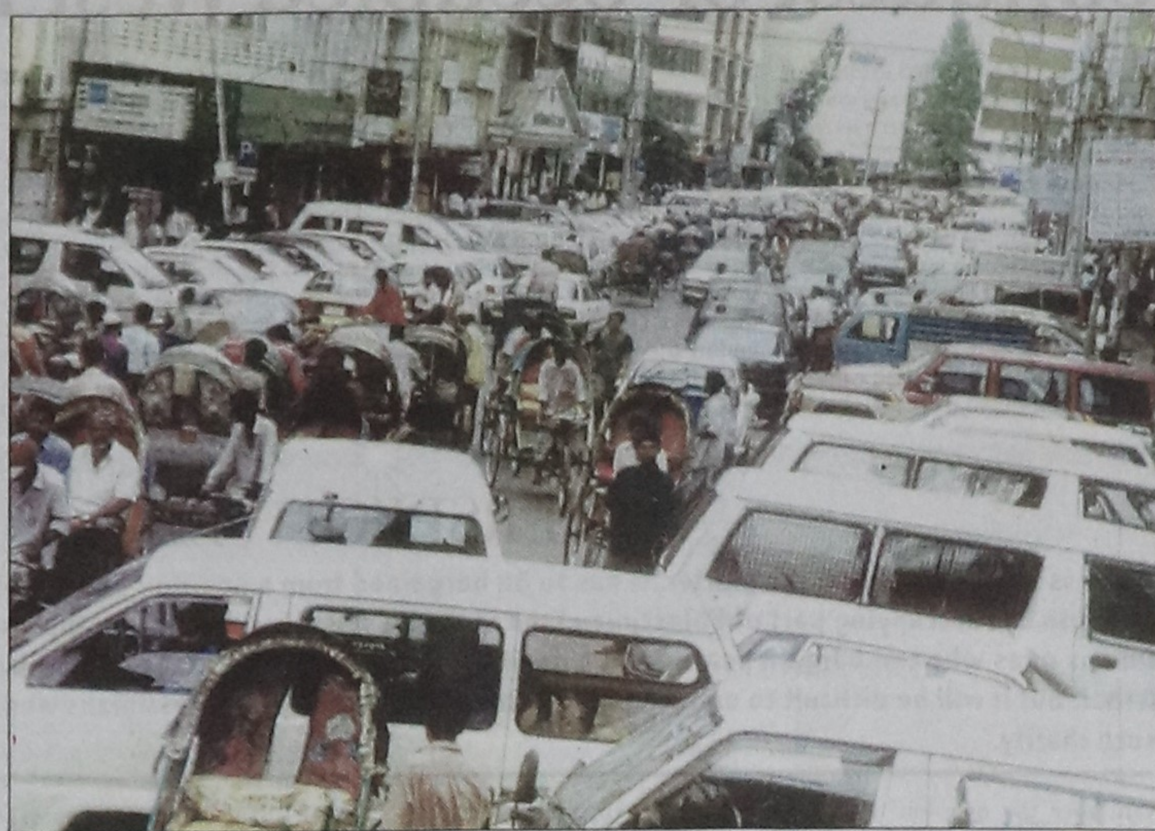
Haphazard parking of vehicles on both sides of the road adds to the traffic congestion in city. This picture was taken from busy Dikusha area of the city yesterday.

The concluding ceremony was followed by screening of short films, which were produced as part of course curriculum.