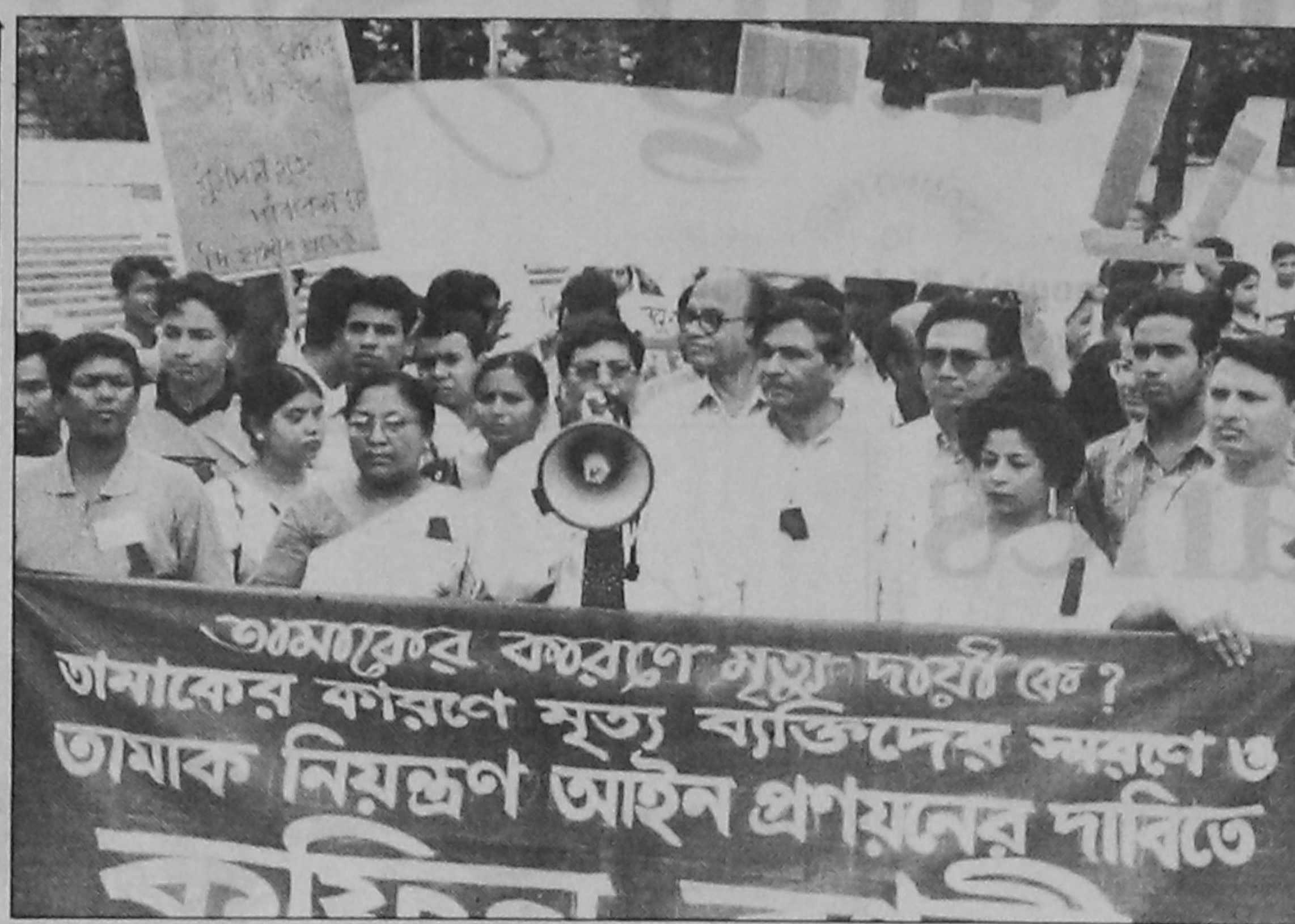
Anti-Tobacco Alliance held a rally at the Central Shaheed Minar in the city yesterday demanding enactment of a tobacco control law.