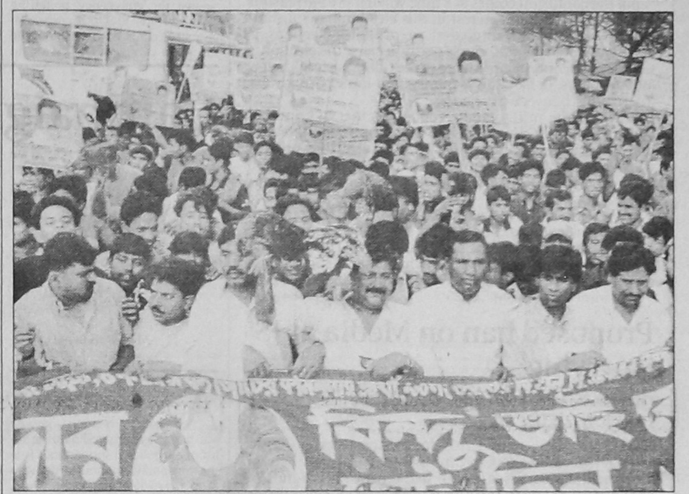
A candidate for the post of ward commissioner in the Dhaka City Corporation election and his supporters brought out a procession in ward No. 90 to woo the voters.

Career opportunity in a reputed Garments Factory : 1. Manager Administration: Must be Graduate, Knowledge / Training in Personnel Management and Industrial & Labour Law. Computer literacy must. Minimum 5 years experience in garments industry. 2. Merchandiser: Minimum Graduate, 3-4 years experience in Garments Industry. Computer literacy must, Ability to liaise with buyer independently. 3. Asst. Accounts Executive: Graduate in Accounting with CA or ICMA (Inter). Computer literacy must. 3-4 years experience in Garments Industry. 4. Electrician : Minimum Diploma-in-Electrical. 3-4 years experience in Garments Industry. 5. Quality Controller: Minimum HSC, 3-4 years experience in Garments Industry (Shirt) Interested persons are requested to apply with full details immediately closing date 14th April, 2002 INTERFAB (BD) LTD. 43, Chalaban, Shah Kabir Mazar Road, Azampur, Uttara, Dhaka-1230, Tel: 8918142.