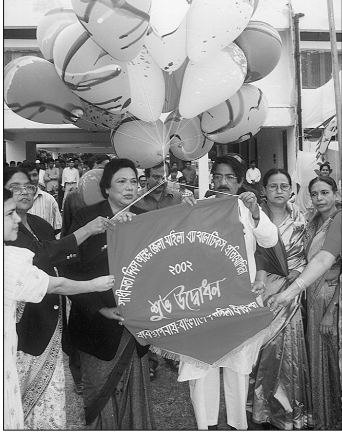
Forest and Environment Minister Shahjahan Siraj inaugurates the Independence Day inter-district women's athletics competition at the Sultana Kamal Women's Sports Complex at Dhanmondi in the city on Wednesday.

Boje replaces New Zealand's Chris Cairns, who is unable to play this summer after suffering a serious knee injury in the recent Test series against England.