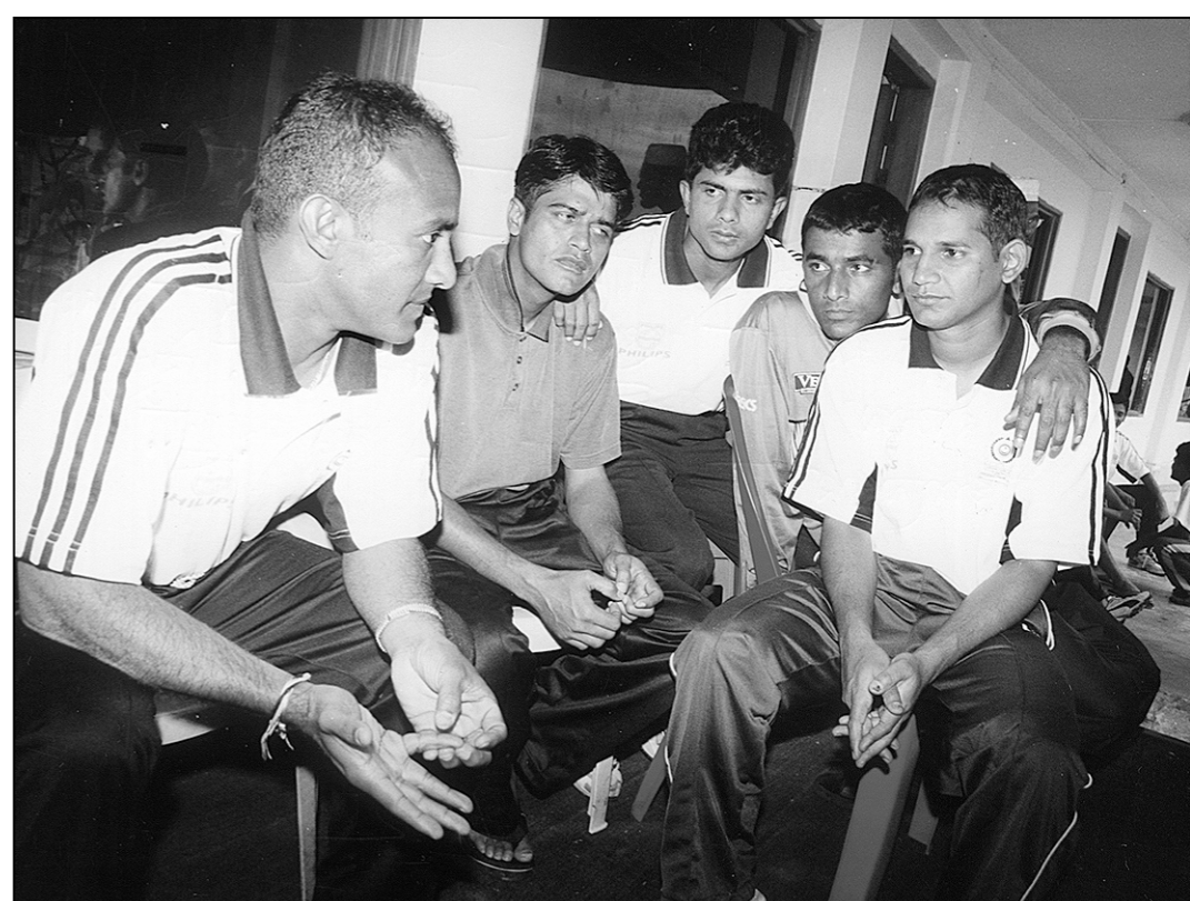
CRICKETERS' DAY-OFF: As rain made sure no play is possible on the day, players of both Mohammedan and City Club engage themselves in a gossip on the verandah of the dressing room of Bangabandhu National Stadium Wednesday.

GrameenPhone Premier Cricket League Mohammedan SC v City Club Venue: Bangabandhu National Stadium. Biman v Surjo Tarun Venue: Dhanmondi Cricket Stadium. Young Pegasus v Young Cricketers Venue: BKSP Metro Premier Division Hockey Usha KC v Wari Club (4 pm) Venue: Maulana Bhasani Stadium. White Plus GM Chess Tournament Round Six Venue: NSC Chess Room.