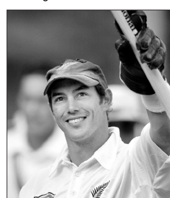
PARORE ... goodbye to cricket

into the Auckland Test and took three catches in the first innings including Andrew Flintoff for number