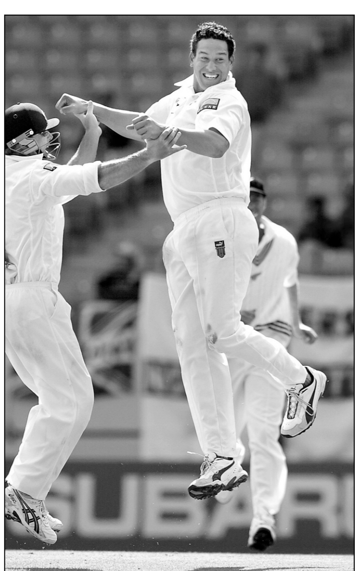
ON CLOUD NINE! New Zealand pacemen Daryl Tuffey (R) celebrates taking the wicket of Mark Ramprakash of England with Mark Richardson on the fifth day of the third and final Test at Auckland on Wednesday. Tuffey was adjudged man-of-the-match.

Mark Butcher was out minutes before Thorpe when he was surprised by one that spat off the pitch from Nathan Astle and was caught at point for 35.