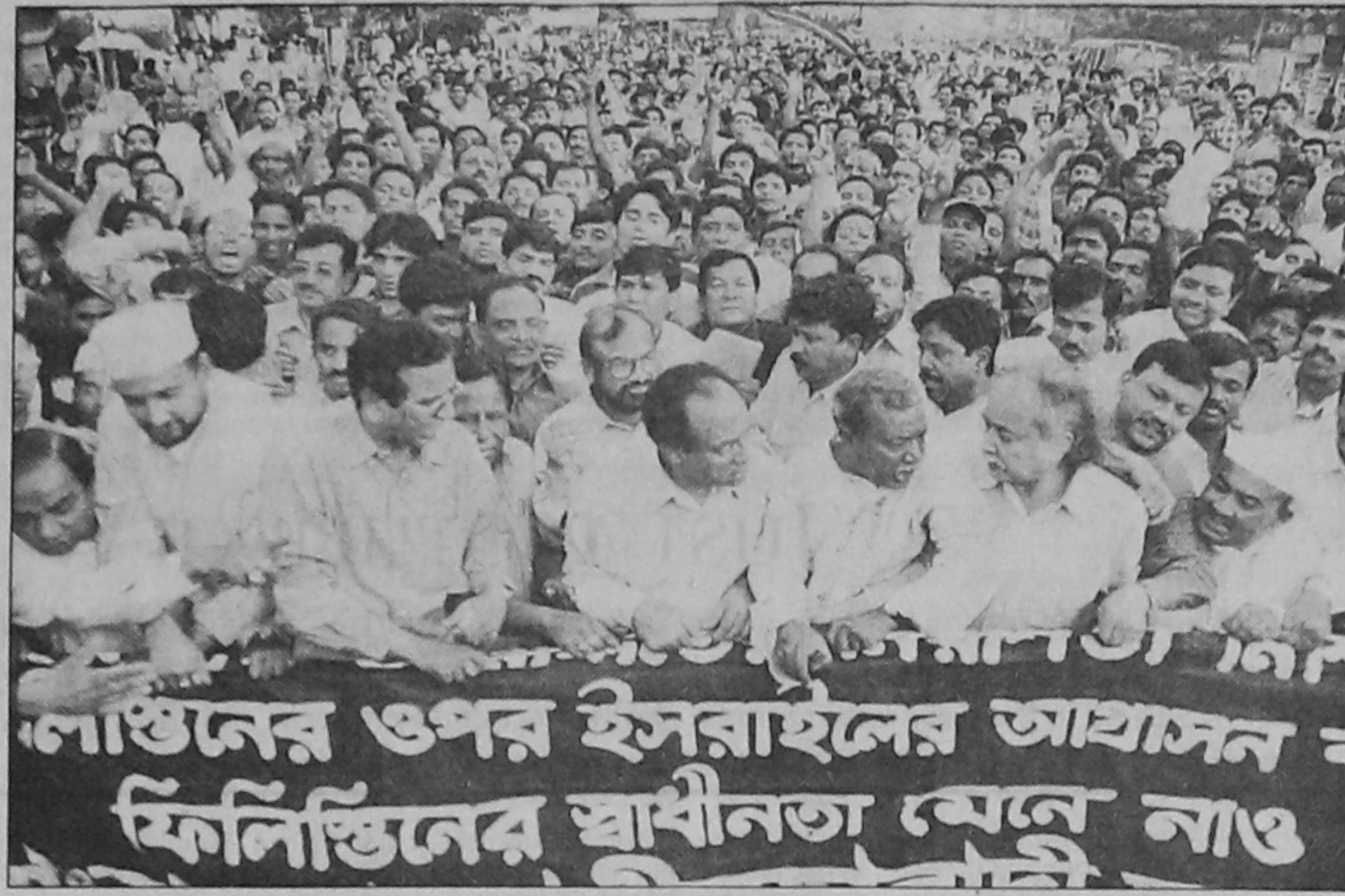
Dhaka City BNP brought out a procession yesterday protesting Israeli attacks on Palestinian President Yaseer Arafat's headquarters in the West Bank city of Ramallah.

The foundation stone of Mohammadpur Model High School, one of the proposed schools, was formally laid on the premises of Dhaka Residential Model School on Tuesday. The new school compound will be set up on three acres of land.