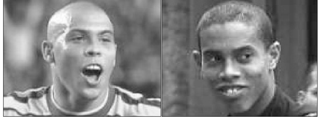
BRAZIL'S ATTACKING TRUMP-CARDS: Inter Milan's Ronaldo (L) and Paris Saint Germain's Ronaldinho.