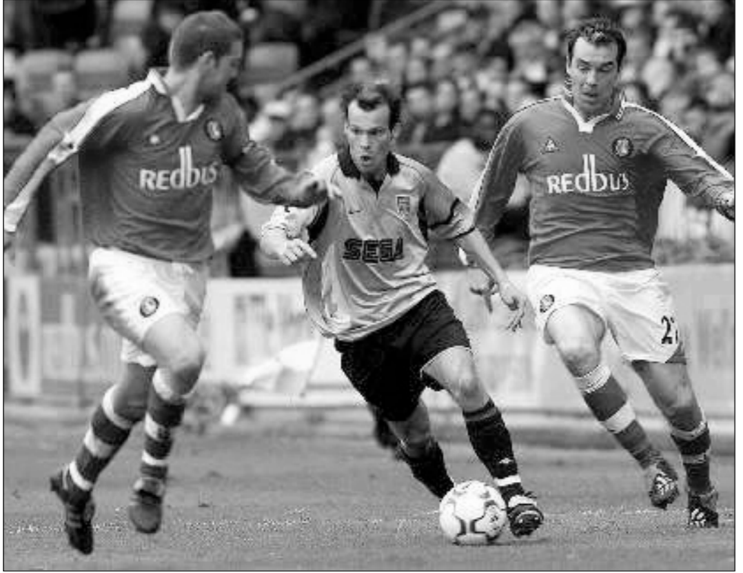
Arsenal's Swedish international playmaker Freddy Ljungberg (C), trying to make his way through two Charlton defenders at the Valley in Charlton on April 1.

squad with a lot of quality players - if they carry on like this, they'll probably win the Bundesliga.