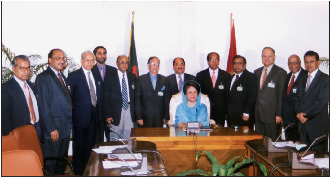
Prime Minister Khaleda Zia with a delegation of the Metropolitan Chamber of Commerce and Industry at her office yesterday.