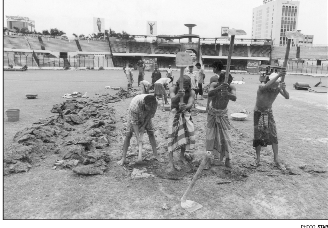
Because of holding football matches at the Bangabandhu National Stadium majority of the seven cricket pitches have been damaged. This photo, taken on Friday, shows the surface of the western-most pitch of the arena is being taken off by workers in order to readjust the slope.