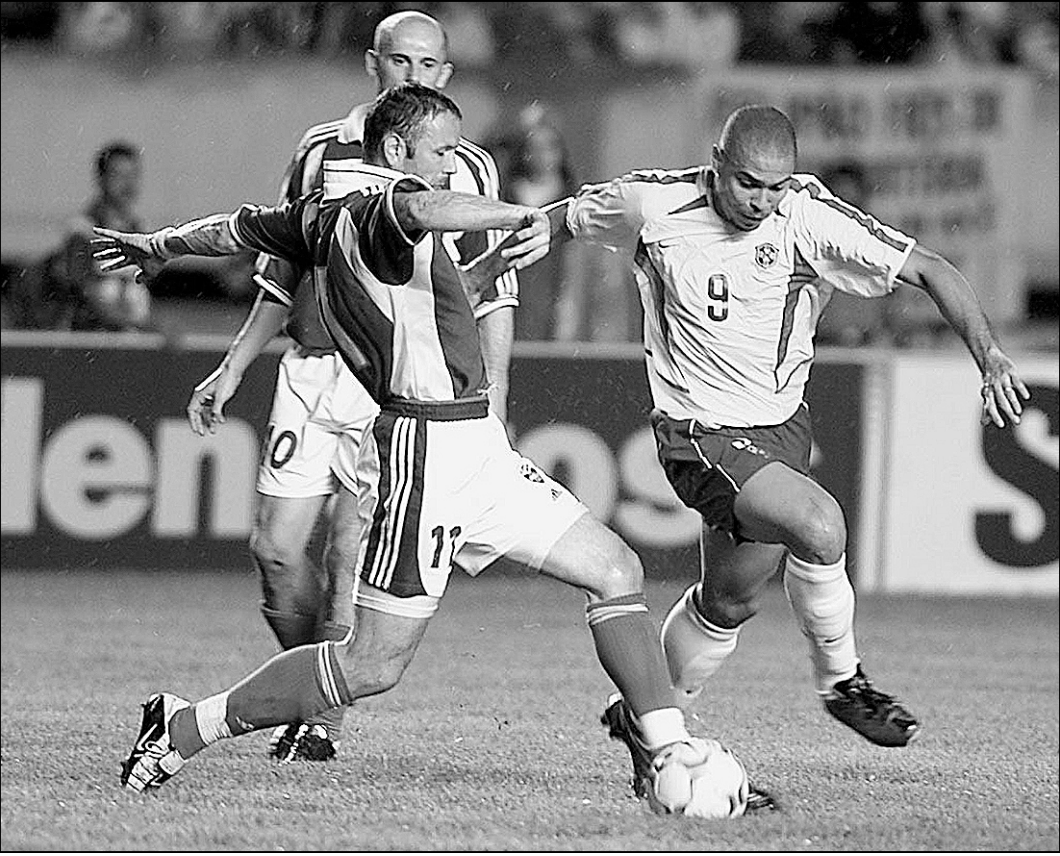
BACK WHERE HE BELONGS: Brazilian superstar Ronaldo (R), trying to get past veteran Yugoslav defender Sinisa Mihajlovic during their international friendly at Fortaleza on March 27.

As the crowd grew impatient, chanting for Romero and shouting "Ole" as the visitors traded passes, Brazil finally got on the board. Cafu lofted a cross from the right side that Lazio defender Sinisa Mihajlovic failed to clear, and Luizao headed the ball in from point-blank range to make it 1-0.