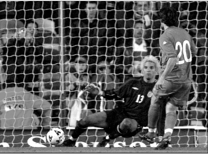
SORRY ENGLAND! Italy striker Vincenzo Montella (R), sends England keeper David James the wrong way to score the match winner from the penalty spot at Elland Road, Leeds on March 27.

Italy coach Giovanni Trapattoni was economical with his praise for match-winner Montella with whom