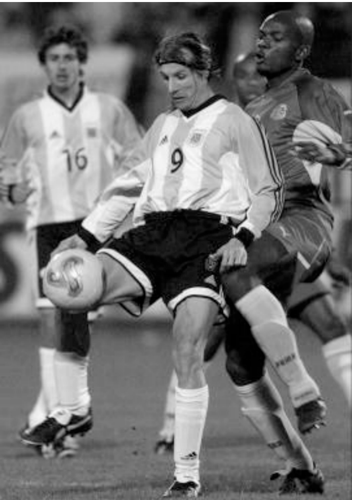
Veteran Argentina forward Claudio Caniggia (No 9) under pressure from Cameroon's Pierre Wome (R) during their Friendly international at Geneva on March 27.

put Argentina ahead after 17 minutes but Cameroon were level three minutes later when Samuel Eto'o was left unmarked to head in at the far post.