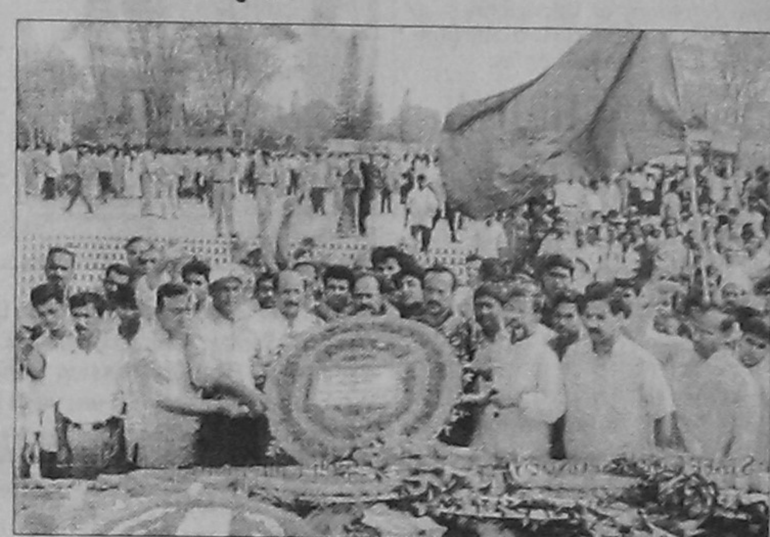
Muktijoddha Sangsad Central Command Council.