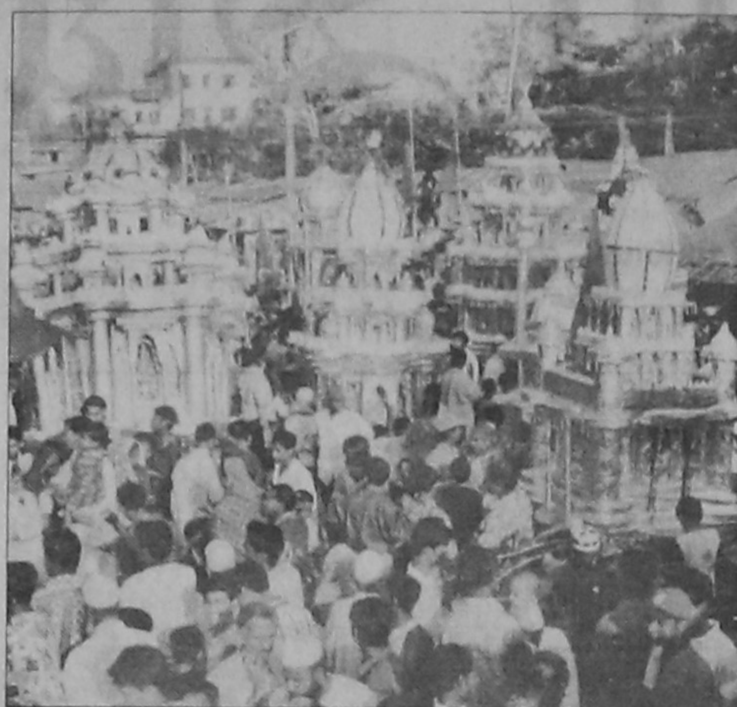
A Tazia procession was brought out in Chittagong on the occasion of the holy Ashura on March 25.