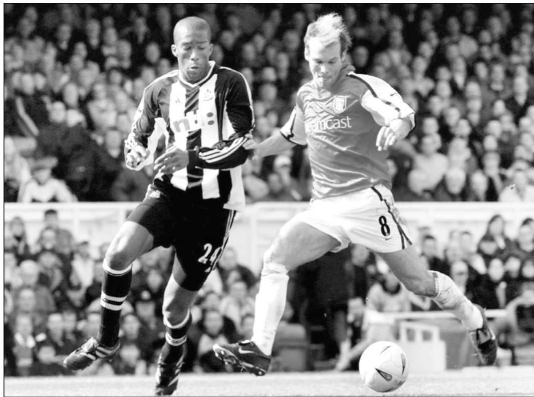
Newcastle United's Sylvain Distin (L) tries to intercept Arsenal's Fredrik Ljungberg during their English Premiership clash at Highbury in London on Saturday.

The Earthquakes open the defence of their Major League Soccer (MLS) crown on Saturday.