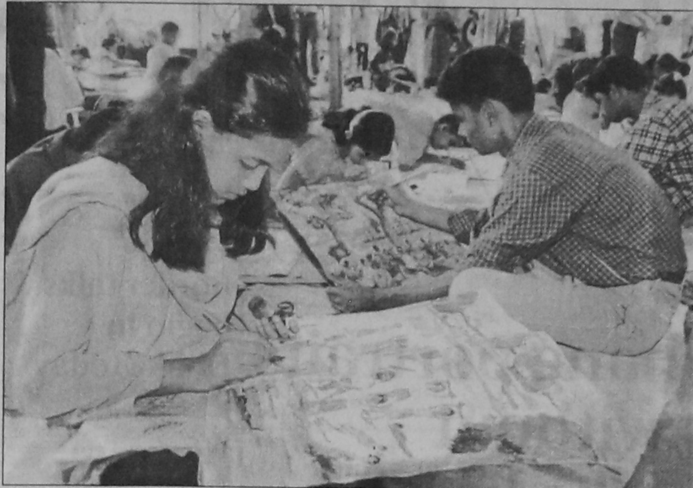
Children take part in a drawing competition at the National Press Club in the city yesterday. The Bangladesh Muktijodha Kalyan Trust organised the competition to mark the Independence Day.

"We should ensure the basic human needs for the already displaced rootless people in the Dhaka city and at the same time create job opportunities in rural areas through strengthening the rural economy to stop further migration," he noted.