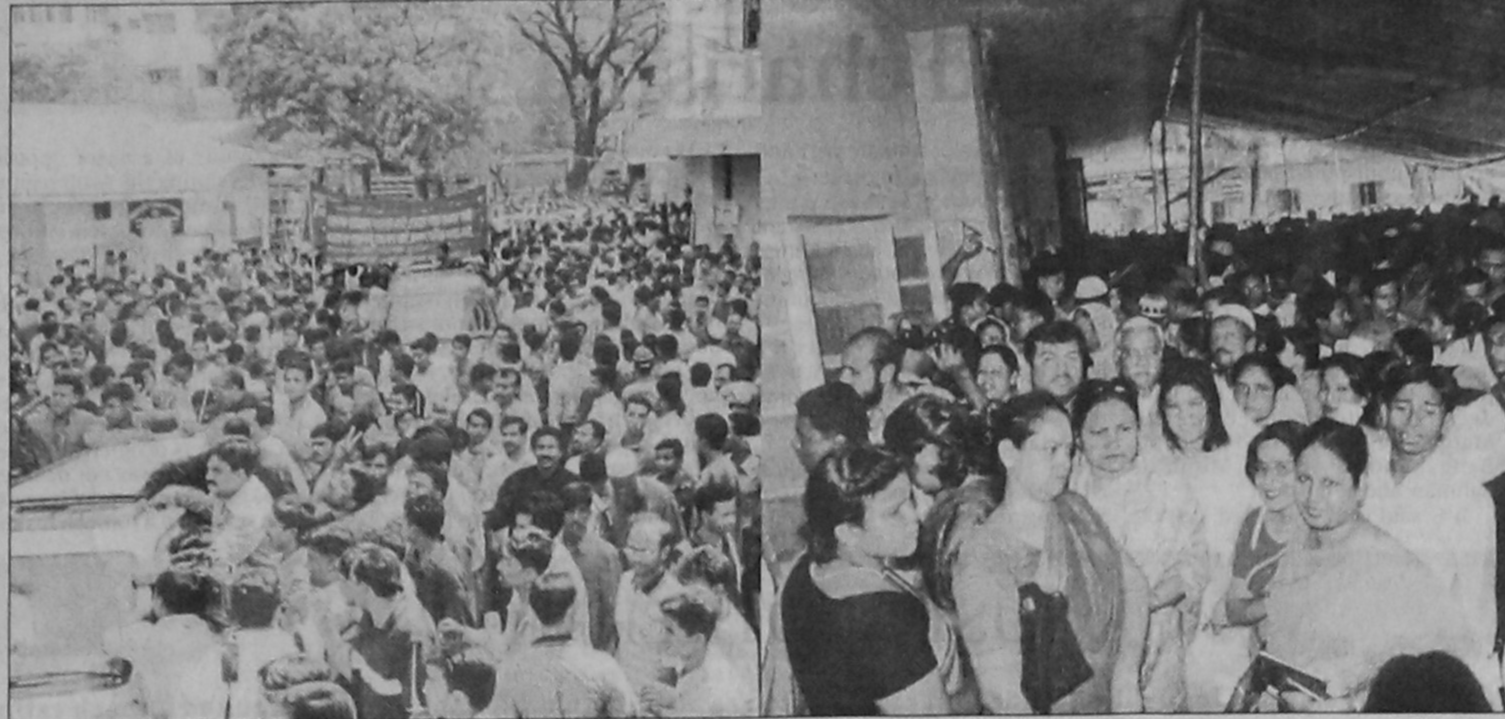
(Left) Candidates for the Dhaka City Corporation elections along with their supporters gathered at the Commissioner's office at Segun Bagicha to submit their nominations yesterday. (Right) Women candidates waiting in a queue to submit their nominations.