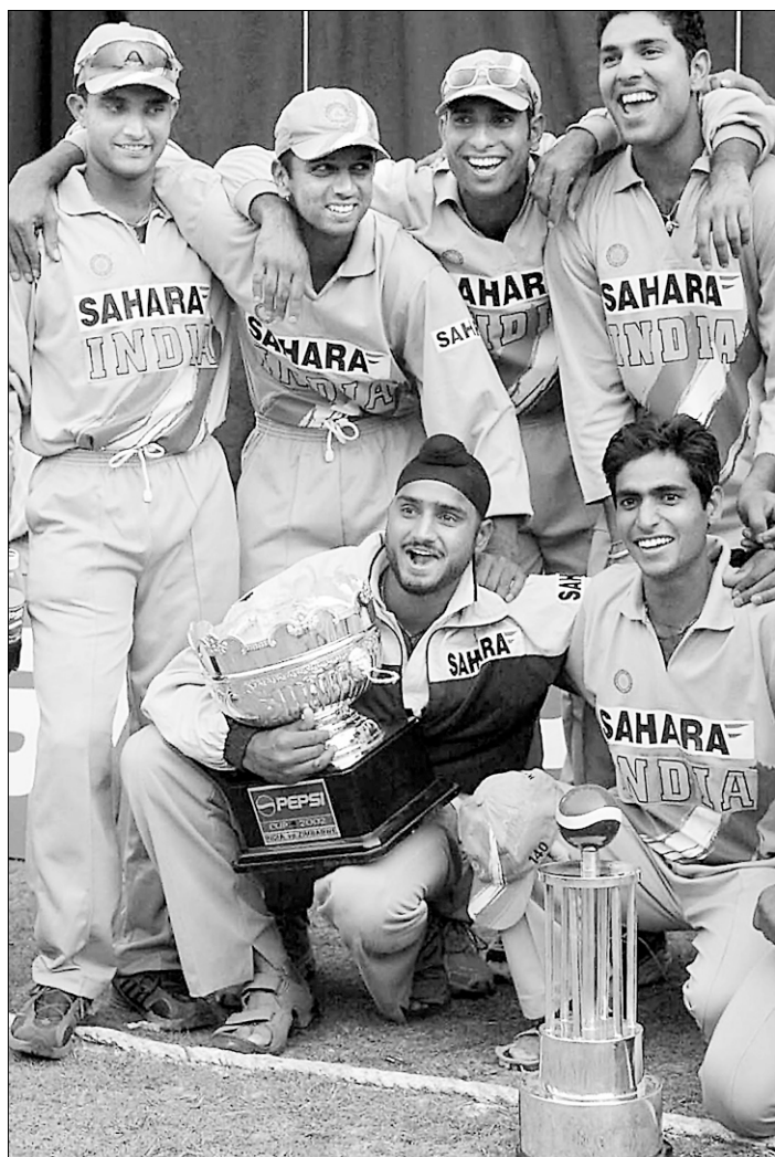
A happy bunch of Indian cricketers pose with their trophies after defeating Zimbabwe in the deciding fifth one-day international in Guwahati on Tuesday.