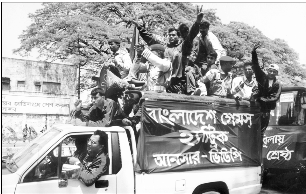
THREE CHEERS FOR ANSARS: Players and officials of Bangladesh Ansars and VDP team brought out a procession in celebration of their hat-trick triumph in the Bangladesh Games.