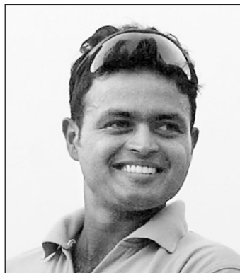
MONGIA ... both m-o-m & m-o-s

Ganguly said: "The performance of our talented young players is certainly a big plus from this series."