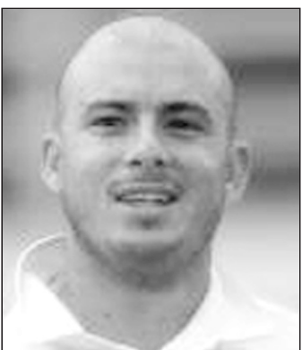
Champion by winning the first

Australia had already won the series, retaining their World Test