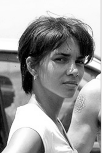
Halle Berry in 'Monsters Ball'