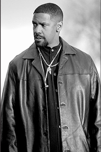
Denzel Washington in 'Training Day'

Fifth national convention of Bangladesh Village Theatre concludes in the city