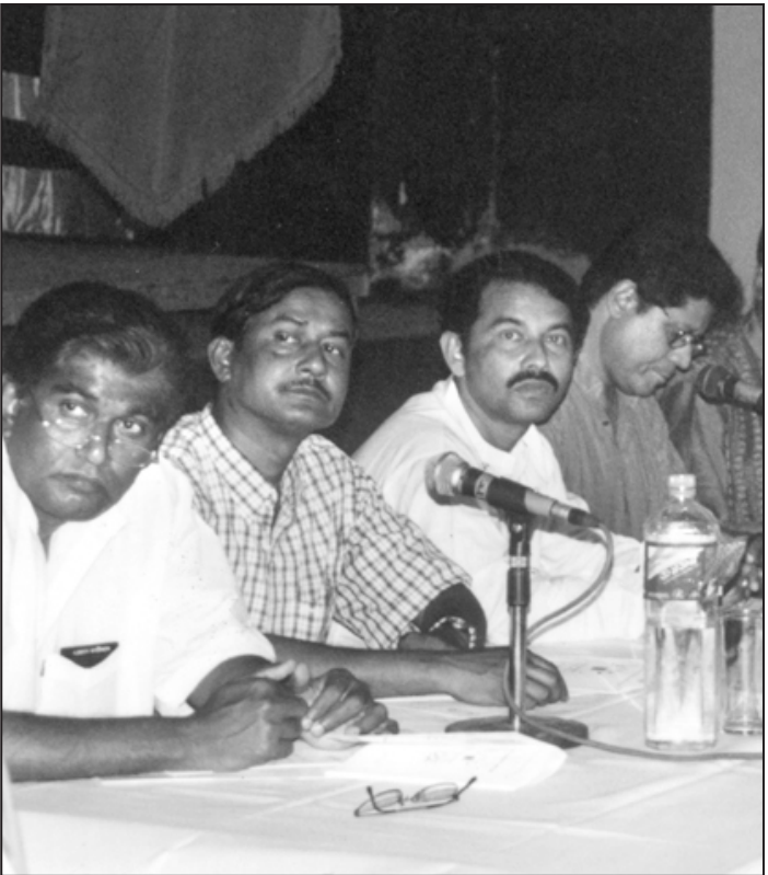
Organisers speak at the closing session of the convention