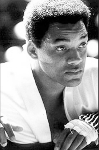
Will Smith in 'Ali'