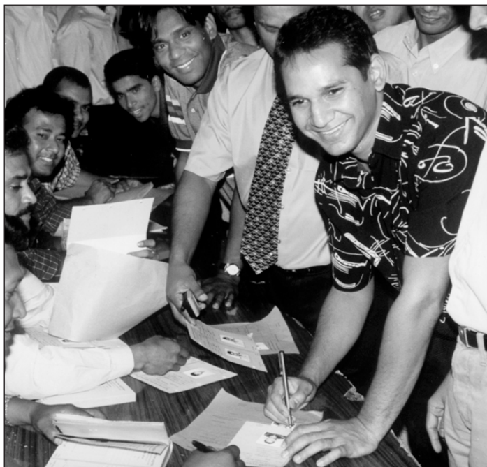
Test star Habibul Bashar is all smiles as he signs for Mohammedan Sporting Club during the cricketers' transfer bourse yesterday.