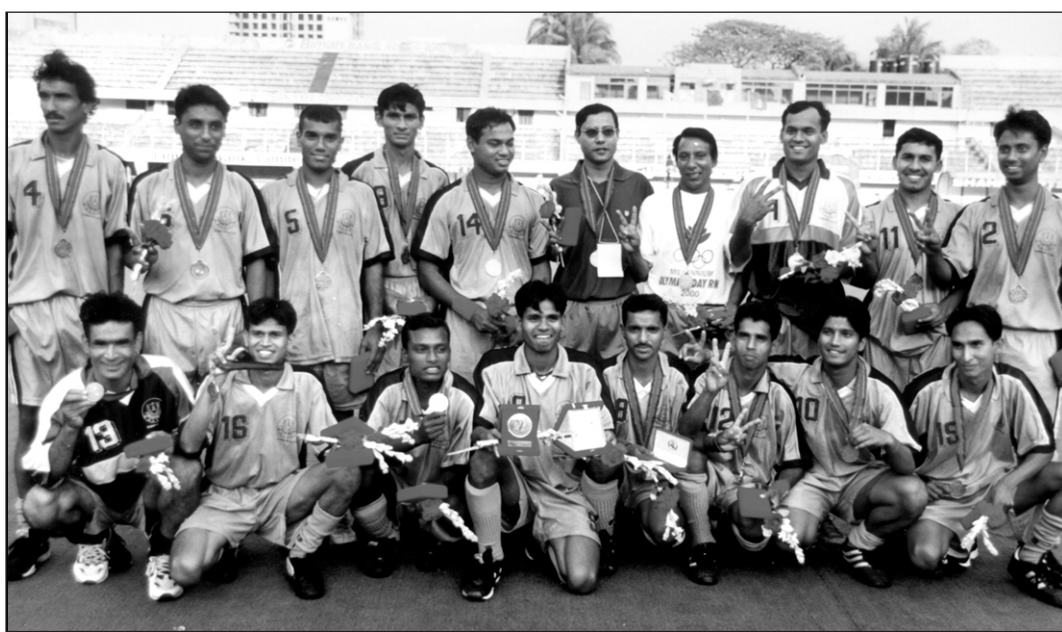
The jubilant Dhaka district hockey team after winning the 7th Bangladesh Games gold at the Maulana Bhasani Stadium yesterday.