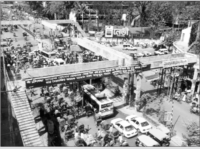
Footsteps to death?

I have carefully gone through your recent reports on the high-rise