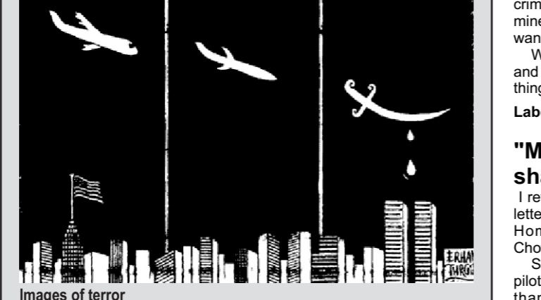
Images of terror