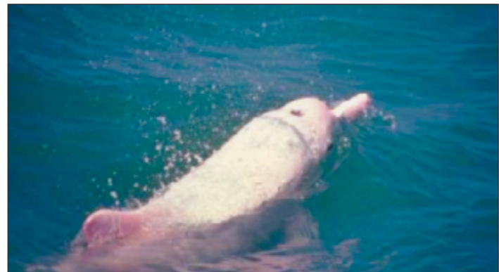
Dorsal fin, head and beak of an Indo-Pacific humpbacked dolphin - Sousa Chinensis.

A team of scientists from home and abroad has spotted for the first time a Dolphin species -- The Indo-Pacific humpbacked dolphin Sousa Chinensis--in the Sundarbans.