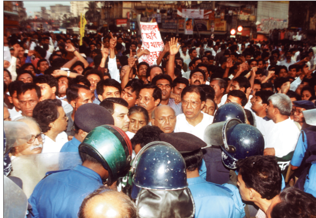
Police intercept an Awami League procession at Paltan crossing in the city yesterday, protesting alleged government repression on the opposition.