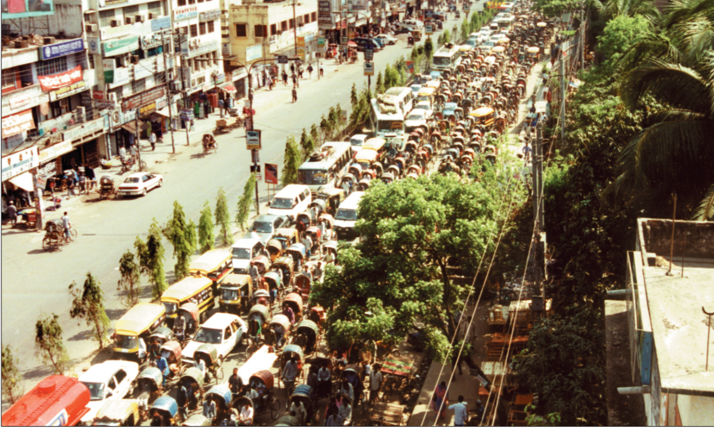
Mirpur Road in front of Dhaka College is choked up by bumper to bumper traffic jam yesterday. Various attempts by the traffic department, including making it a one-way lane, did little to improve the situation.