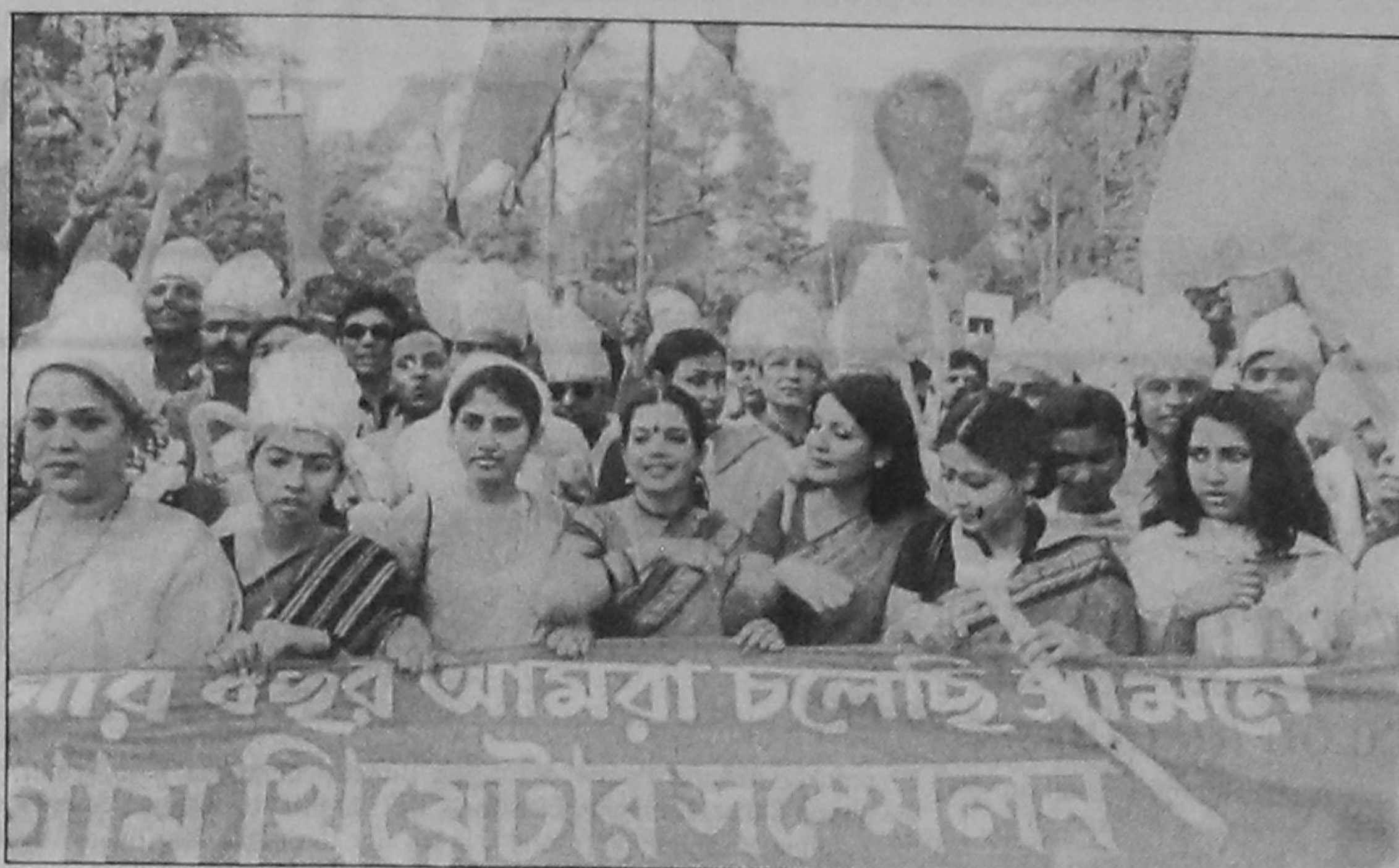
Dhaka Theatre brought out a colourful procession in the city yesterday to mark its week-long drama festival and the Gram Theatre council. The festival began at the Mahila Samity auditorium yesterday.