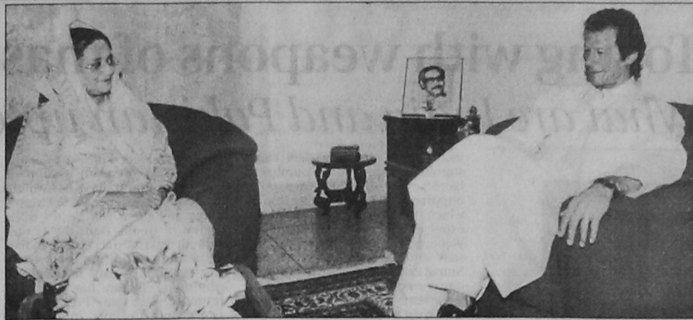
Pakistani ace cricketer-turned-politician Imran Khan called on Leader of the Opposition in Parliament and Awami League chief Sheikh Hasina at her Sudha Sadan residence in the city yesterday.