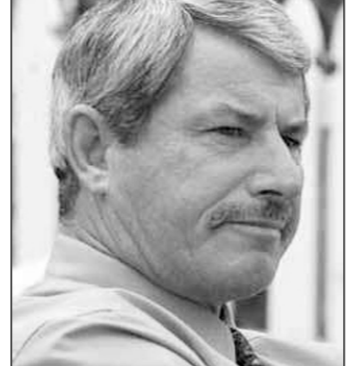
SIR RICHARD HADLEE

Hadlee improved to such an extent that he lies third in the list of