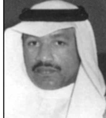
MOHAMMED BIN HAMMAM

Between 1992 and 1996 he was president of the Qatar Football Association before moving to FIFA.