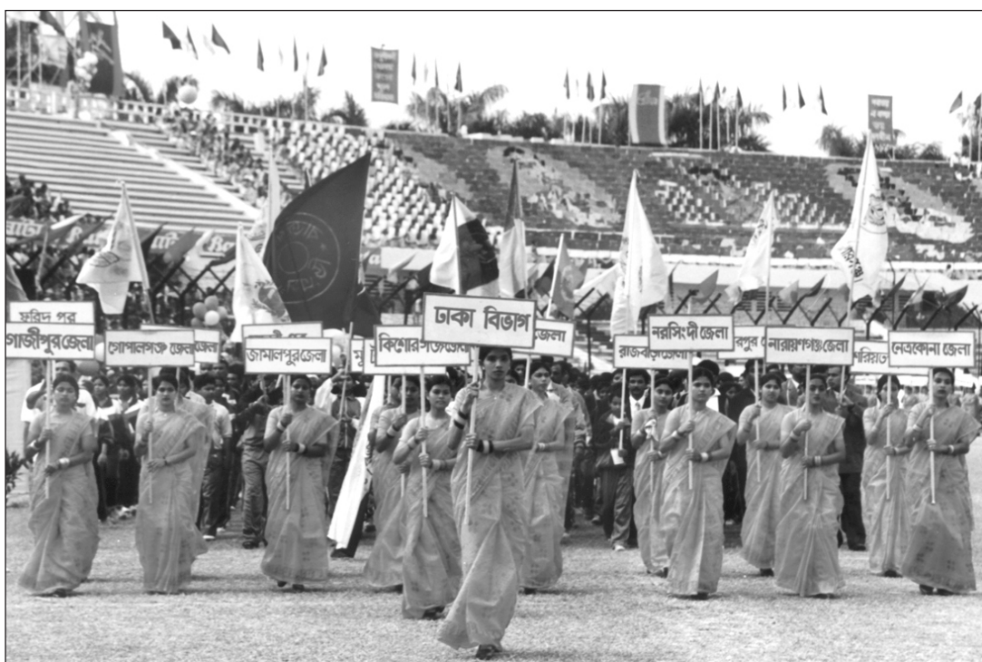
(L) Young ladies hold placards of participating teams as they lead the athletes' march past. (R) Prime Minister Khaleda Zia releases colourful balloons while declaring the Bangladesh Game open.