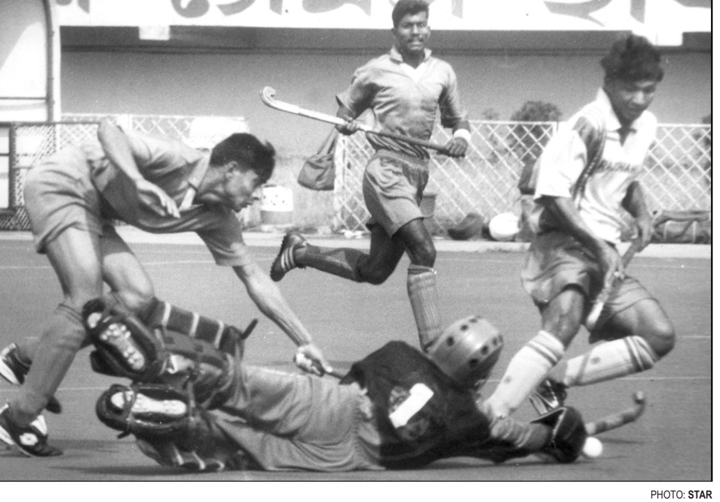
A tense moment in front of the Rajshahi goalpost during the Bangladesh Games hockey encounter against Bangladesh Army on Saturday.