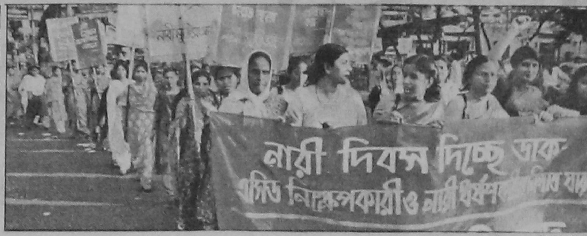
Bangladesh Nari Mukti Sangsad brought out a procession in the city yesterday on the occasion of International Women's Day calling for an end to cruelty against women.