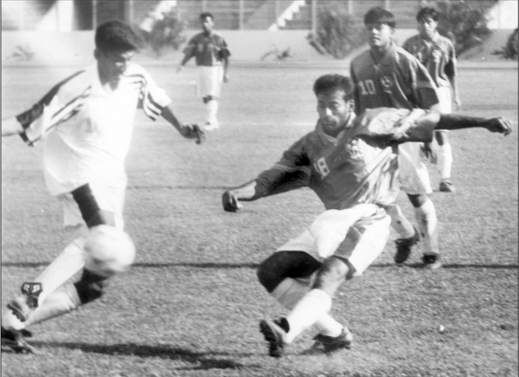
Action from the Bangladesh Games football match between Dhaka and Bangladesh Navy at the Sher-e-Bangla National Stadium yesterday.