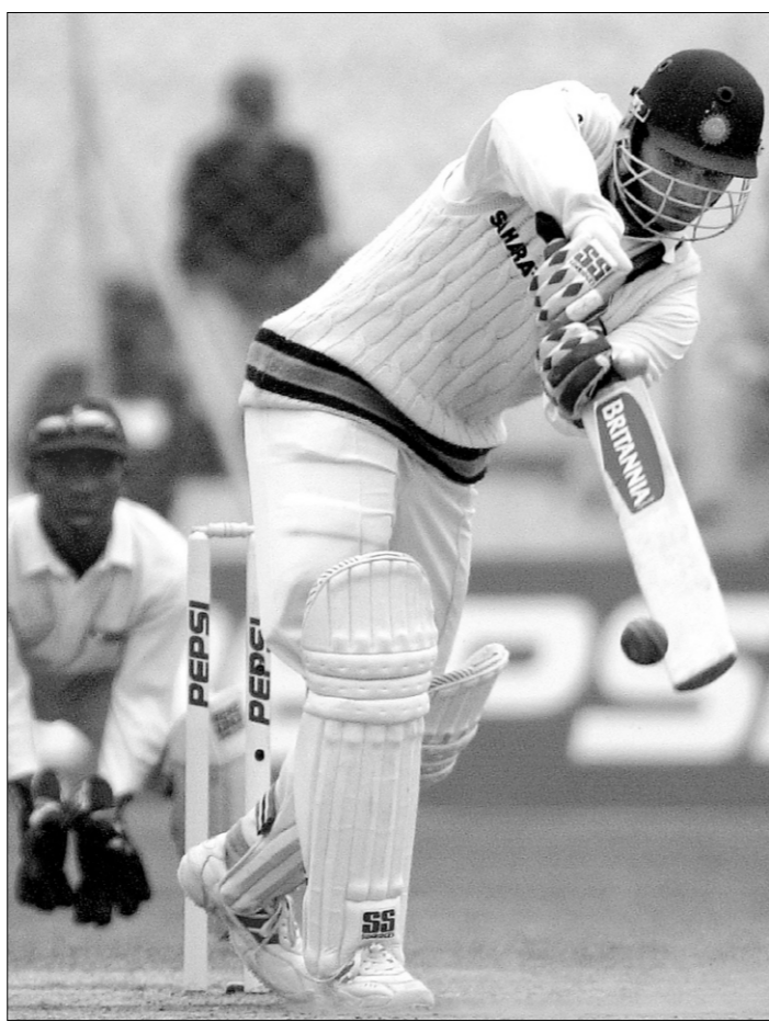
Sourav Ganguly works the ball on the on-side on the third day of the second Test against Zimbabwe in New Delhi yesterday. The Indian captain converted his overnight unbeaten 78 into a hundred on the day.