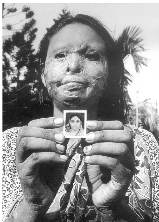
Every year the number of such impaired faces increases - can stern law stop the trend?

Despite laws banning the practice, social and traditional norm helps families decide to demand and give dowry. According to the Dowry Prohibition Act, both giving and receiving dowry is a punishable offence. Like rape, dowry related violence is helped by 'society' and members of it who demand that dowry be given or voluntarily give dowry. In rural Bangladesh and even in families in the urban areas, incessant demands for dowry after marriage cumulate in both mental and physical torture and even in murder. There were 163 reported cases of dowry