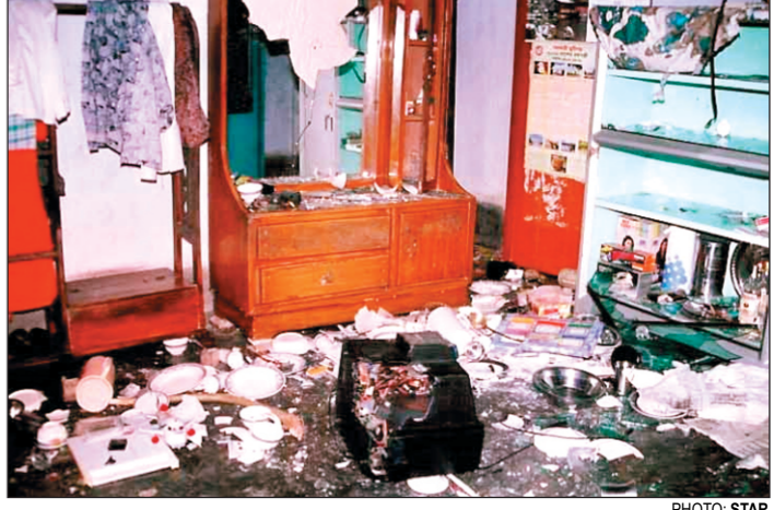
Scene of a vandalised house at a Christian village at Chatmahar.