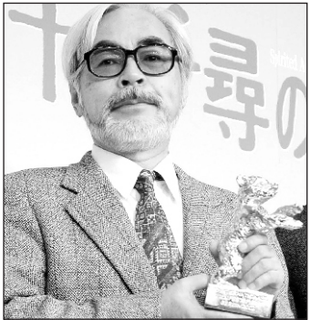
Japanese animated film director Hayao Miyazaki with the Golden Bear trophy - the top prize of the Berlin Film Festival

"Can children get anything out of sitting and watching videos for