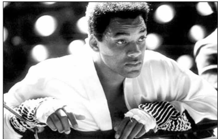
Will Smith portrays the character of Muhammad Ali in the movie 'Ali'

Will Smith played former world champion boxer Mohammad Ali in