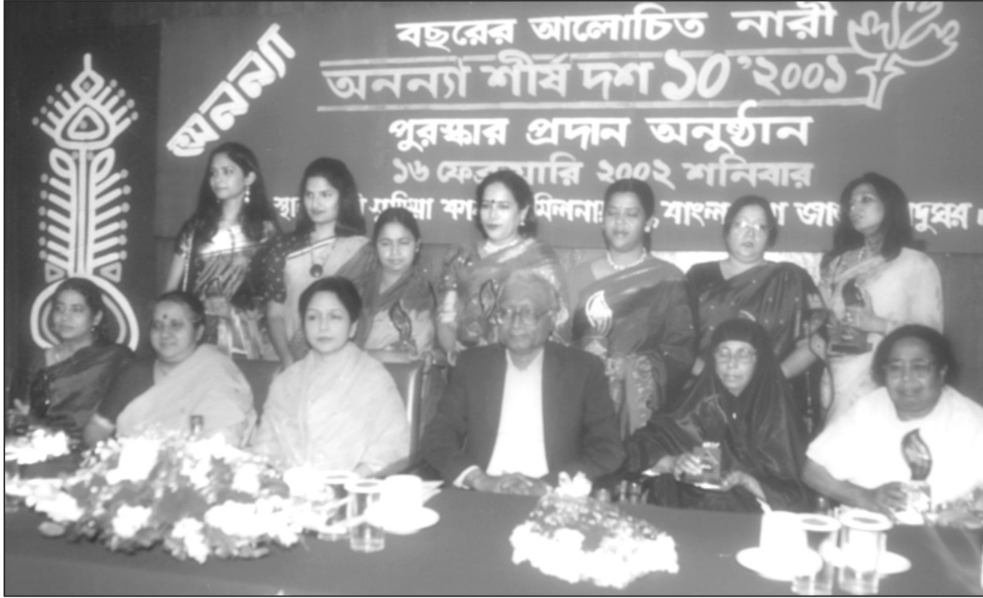
The 10 best award winners with the respective guests at the 'Anannya Best Ten 2001' award presenting ceremony