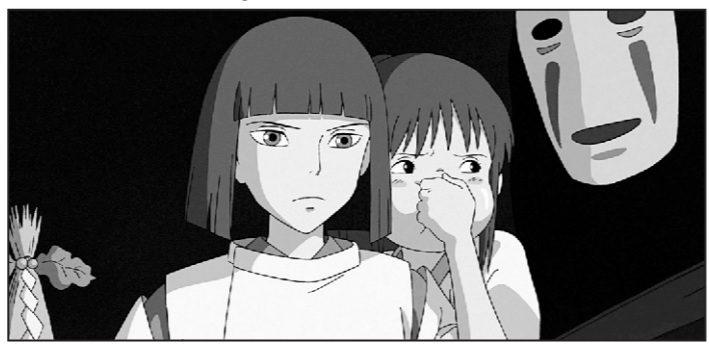
An undated picture shows a scene of Japanese animated cartoon 'Spirited Away' of director Hayao Miyazaki. 'Spirited away' won the Golden Bear at the Berlin film festival 17 February 2002.