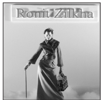
A model wears a design from Ronit Zilkha during fashion week in London, 17 February 2002