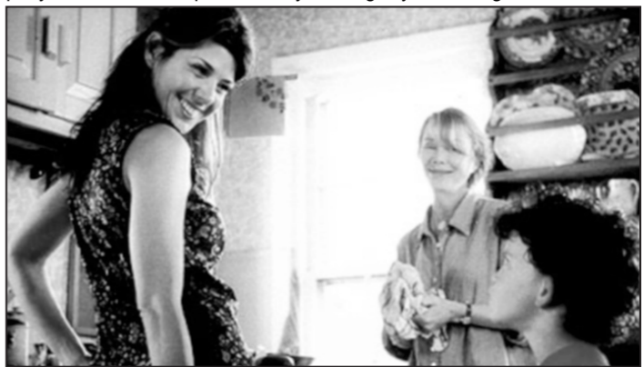
A scene from the movie 'In the Bedroom'

Eight of this year's acting nominees -- in the four categories for best leading and supporting male and female actors -- are previous Oscar winners including Crowe, Ben Kingsley, Jon Voight, Judi Dench,