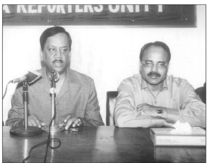
State Minister for Youth and Sports Fazlur Rahman speaks during the Meet the Reporters programme organised by Dhaka Reporters' Unity at its office yesterday.