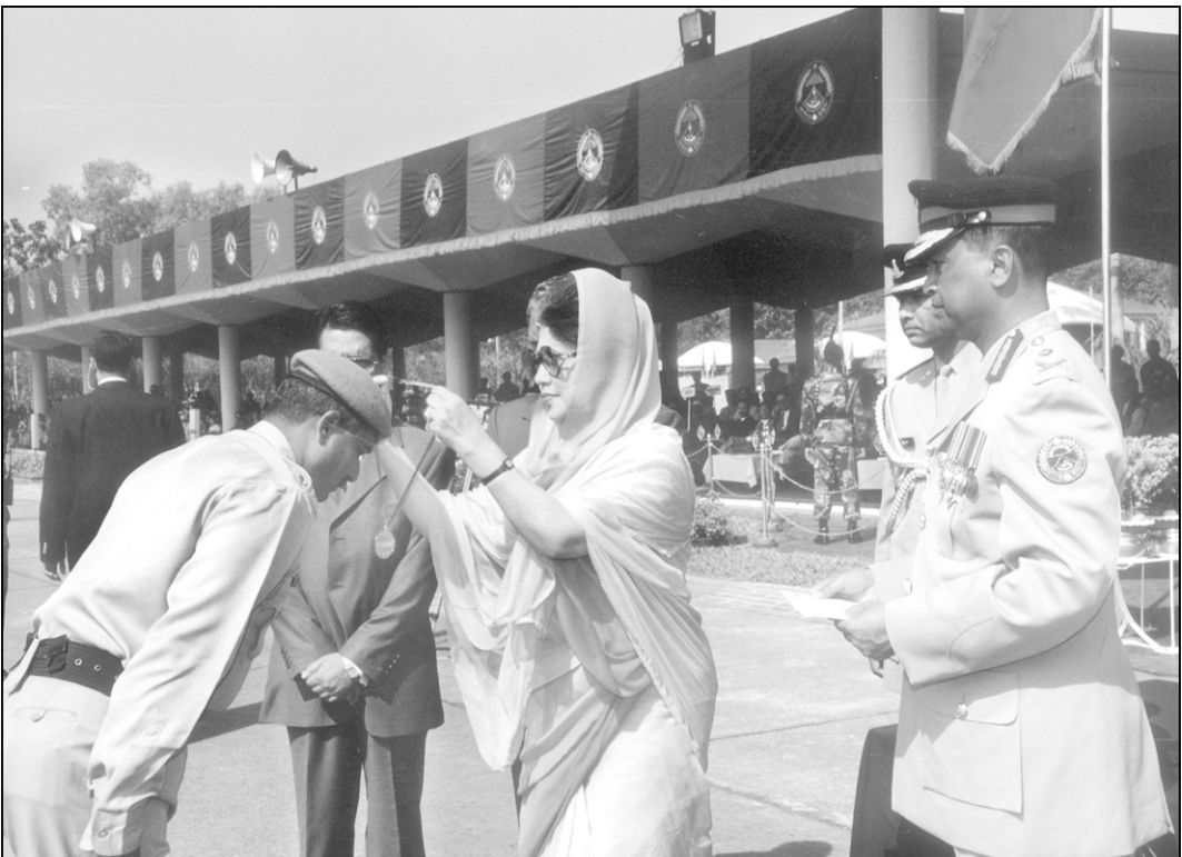
Prime Minister Khaleda Zia presents awards to members of the Ansar and VDP at their National Rally and Parade 2002 at Shafigapur yesterday.

FROM PAGE 12 displays of sympathy and support in the wake of the terrorist attacks," Bush said. "Today, all three nations are supporting our fight against terrorism." On Friday, the North's state-run radio called Bush "the most evil and war-crazed president in the history of the United States." South Korea's national police said they will go on alert because activists were planning demonstrations against Bush's trip. "Bush is a war maniac and an international hooligan," 500 anti-US activists chanted in downtown Seoul on Saturday. During his visit, Bush also planned to give a boost to Japanese Prime Minister Junichiro Koizumi, whose approval ratings have sagged along with that nation's economy. Koizumi has offered a painful program of changes designed to right the Japanese economy and banking system. "Today, Japan is in the midst of economic uncertainty and transition," Bush said. "But I have great confidence in Japan's future and in the unlimited potential of its people, and I'm confident that Japan will make the bold reforms needed to restore growth and opportunity, which will benefit the people of both our nations." Bush also said he will prod the Chinese government to open up their markets to American agricultural products, and to embrace "the universal demands of human dignity, freedom of conscience and religion, and the rights and value of every life."