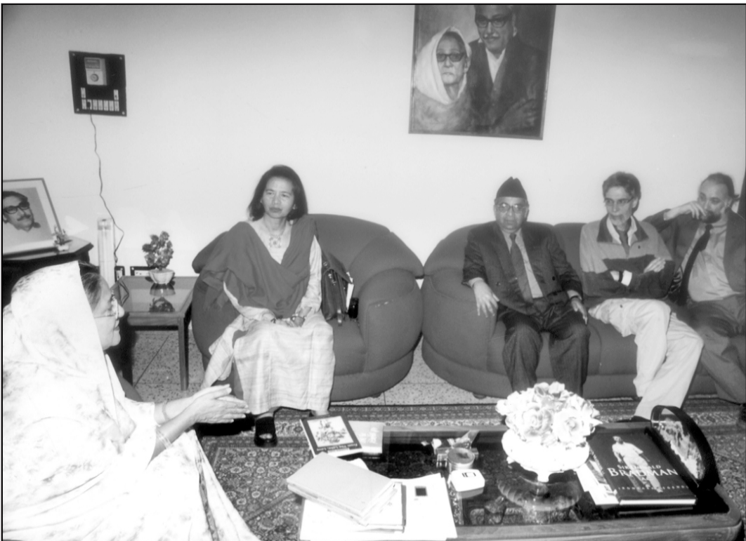
Foreign delegates who joined the national convention titled "Crime against Humanity" called on Awami League President and Leader of the Opposition in Jatiya Sangsad Sheikh Hasina at Sudha Sadan yesterday.